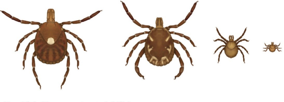
Dog Tick (Dermacentor variabilis)